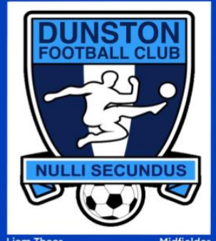
Liam Thear Midfielder Home shirt sponsor: Tom Newton - TMP Away shirt sponsor: Tom Newton - TMP 3rd shirt sponsor: Caleb and Isabella Whalen Training shirt sponsor: