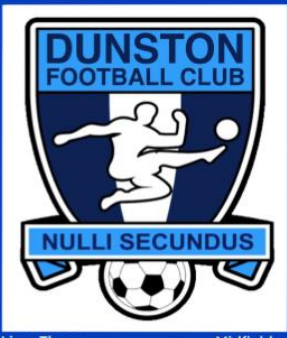
Liam Thear Midfielder Home shirt sponsor: Tom Newton - TMP Away shirt sponsor: Tom Newton - TMP 3rd shirt sponsor: Caleb and Isabella Whalen Training shirt sponsor: