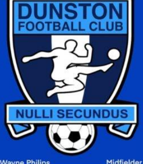
Wayne Phillips Midfielder Home shirt sponsor: D&M Lord Away shirt sponsor: [Sponsor Name] 3rd shirt sponsor: [Sponsor Name] Training shirt sponsor: [Sponsor Name]