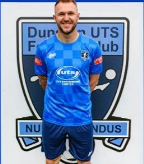
Dale Pearson Forward Home shirt sponsor: Billy Irwin - Painter and Decorator Away shirt sponsor: Paul King 3rd shirt sponsor: Beauty Time Photography Training shirt sponsor: